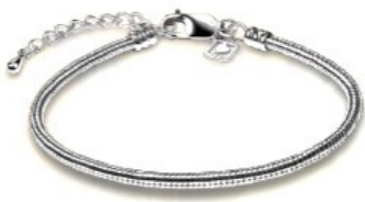
Bracelet is sold separately AUNL2BR - Bracelet