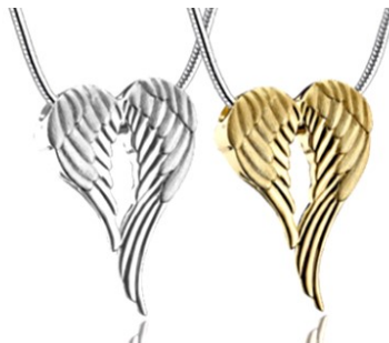
ANGEL WINGS AUNL1370