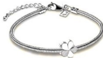
AUNL2040 - Bloom *