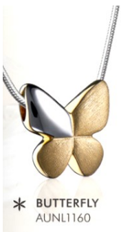
* BUTTERFLY AUNL1160