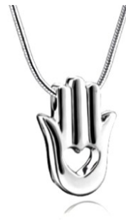
HAMSA HAND AUNL1380