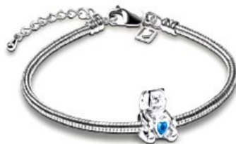
AUNL2081 - Blue Bear