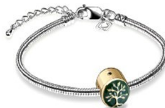
AUNL2121 Tree of Love