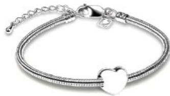
AUNL2000 - LoveHeart *