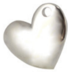
8096 - Heart