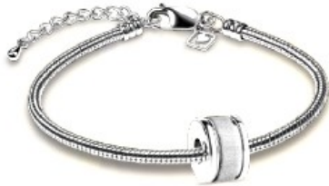
AUNL2010 - Omega *

Each piece comes with its own high quality treasure box for protection and a polishing cloth with care instructions.