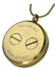
COMPANION ROUND P 3cm H

The Tree Round Pendants also come as a companion piece. The design includes two compartments for holding cremains (or other keepsake).