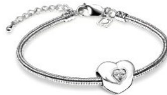
AUNL2003 - Heart to Heart