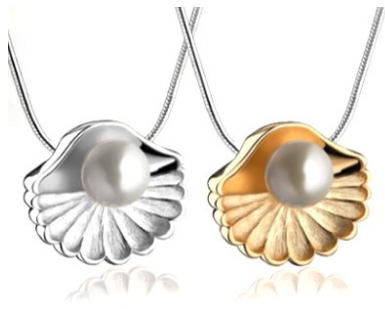
SEA SHELL AUNL1480