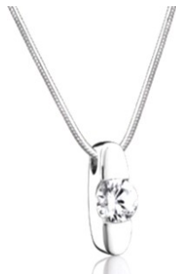
* HOPE AUNL1080