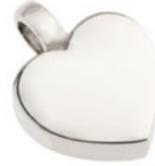
8159S - Plain Heart