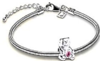
AUNL2080 - Pink Bear

Prices range from $286.50 - $432.00 Please note bracelet is sold separately. $145.50