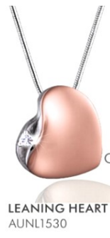
LEANING HEART AUNL1530