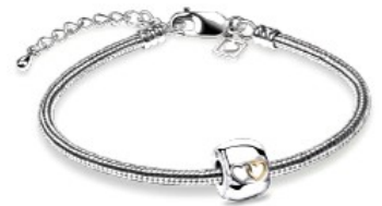
AUNL2014 - Entwined Hearts

A meaningful and heartfelt collection of cremation memorial jewellery in 925 sterling silver, a comforting way to keep the memory of your loved one close.