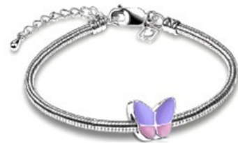
AUNL2090 - Wings of Hope Lavender