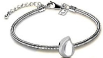
AUNL2060 - Teardrop *