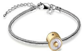
AUNL2122 - Mother of Pearl *