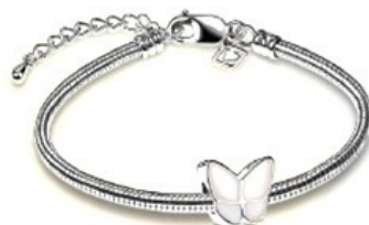
AUNL2092 - Wings of Hope Pearl