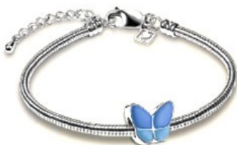
AUNL2091 - Wings of Hope Blue