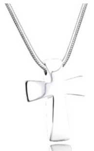
PLAIN CROSS AUNL1090